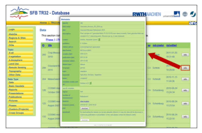
Figure 4. Request on type 'data' with metadata info window

keywords, creator, and regions/sites. As result of all searches by the web-interface, a list of datasets will be displayed (Figure 4).