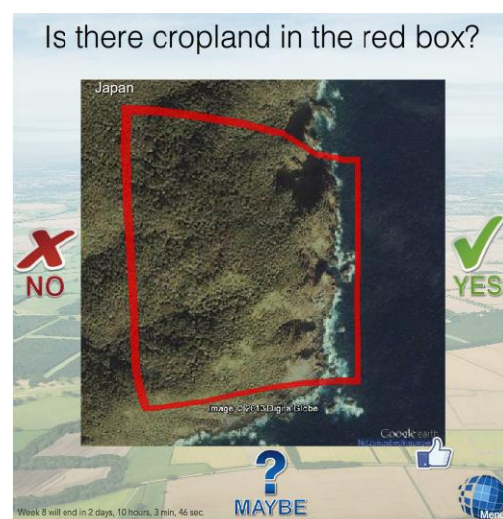
Follow us on twitter to get the latest news about Cropland Capture!

With each image interpretation, which consists is answering if cropland is present, not present, or maybe present (i.e. yes, no or maybe – see Figure 3), the following metadata are collected: an image classification number; a user identification number; the date and time of the classification; whether the answer was correct in relation to the majority; and the device used by the player, i.e. browser, tablet, smartphone and the operating system (Android or Apple). Each image classification number has an associated location, the resolution of the pixel for interpretation (in the case of satellite imagery), or a photograph identification number, which is linked back to the source, e.g. the Degree Confluence project identifier.